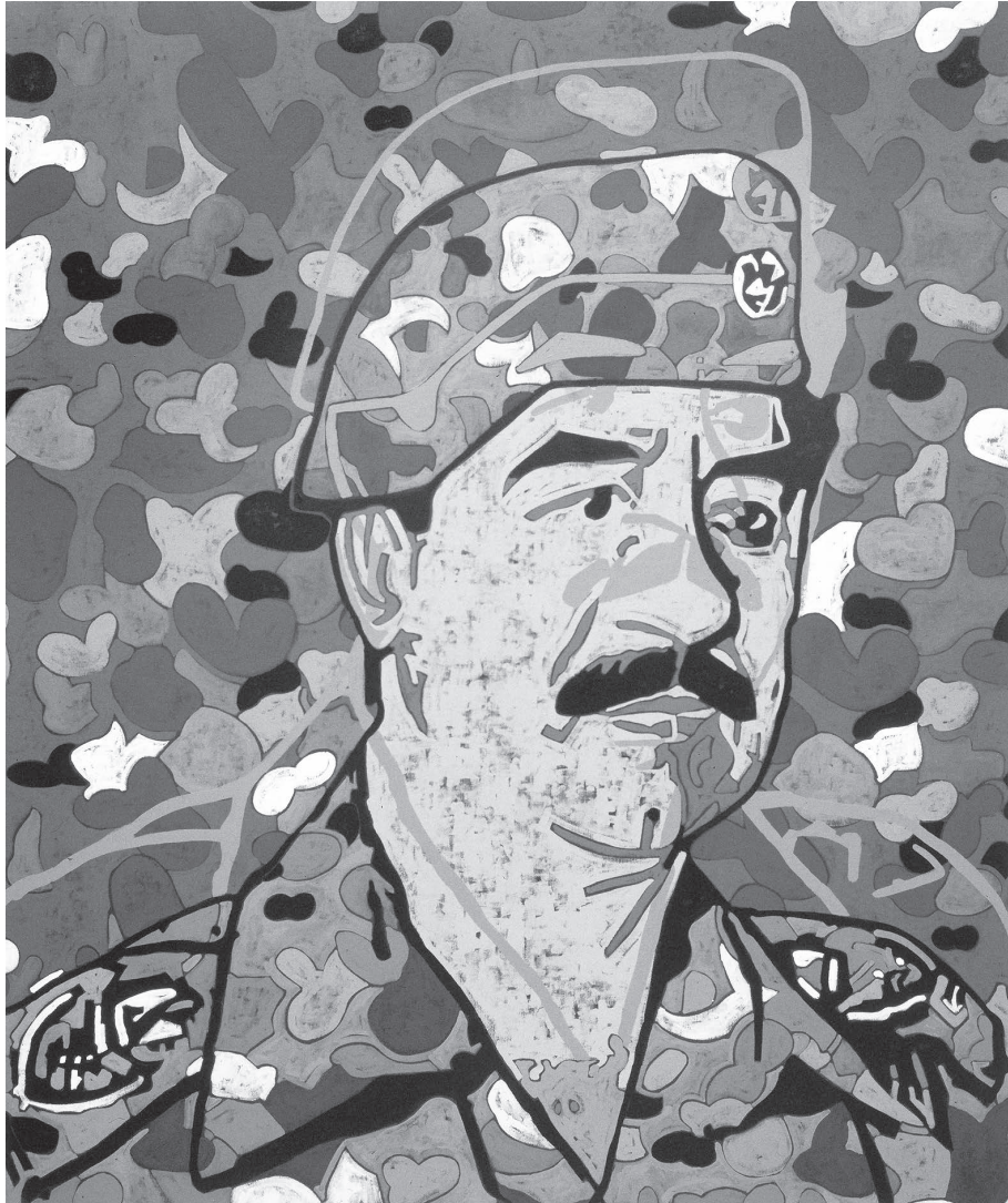
Figure/Ground (Zero): The Camouflage Works of Gordon Bennett and Andy Warhol