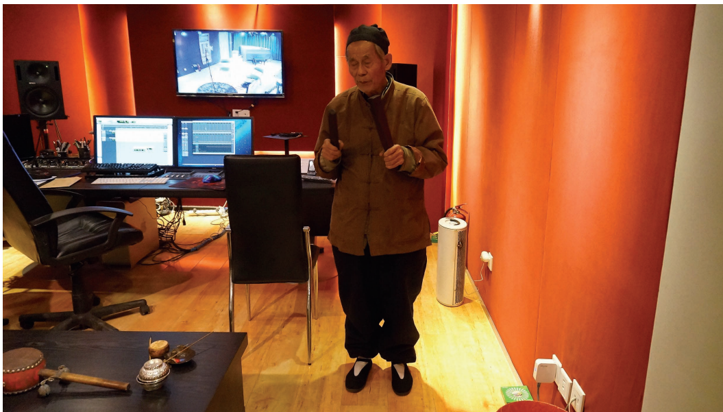
Sounding Out Beijing's Past and Present