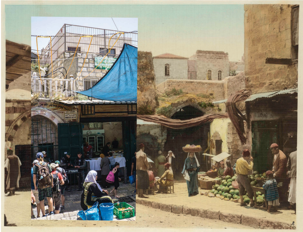
'One Hundred Years' On: The Worn Away Mask of Jerusalem