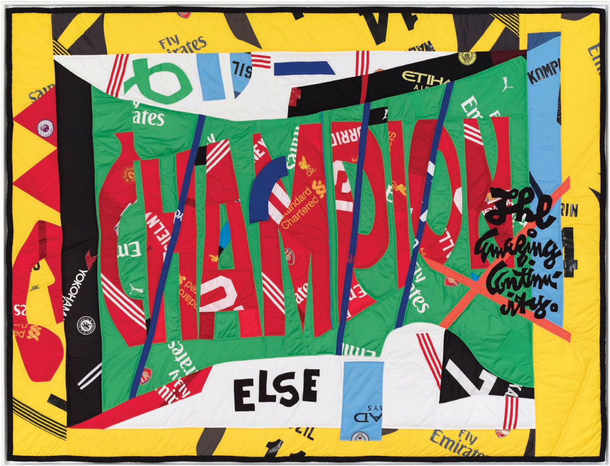
This Beautiful, Tangled, Chaotic Game: On Three-Sided Football, Triolectics and World Space(s)