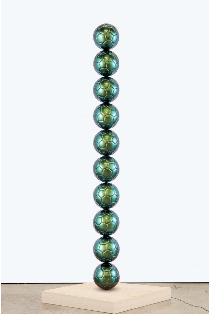
This Beautiful, Tangled, Chaotic Game: On Three-Sided Football, Triolectics and World Space(s)