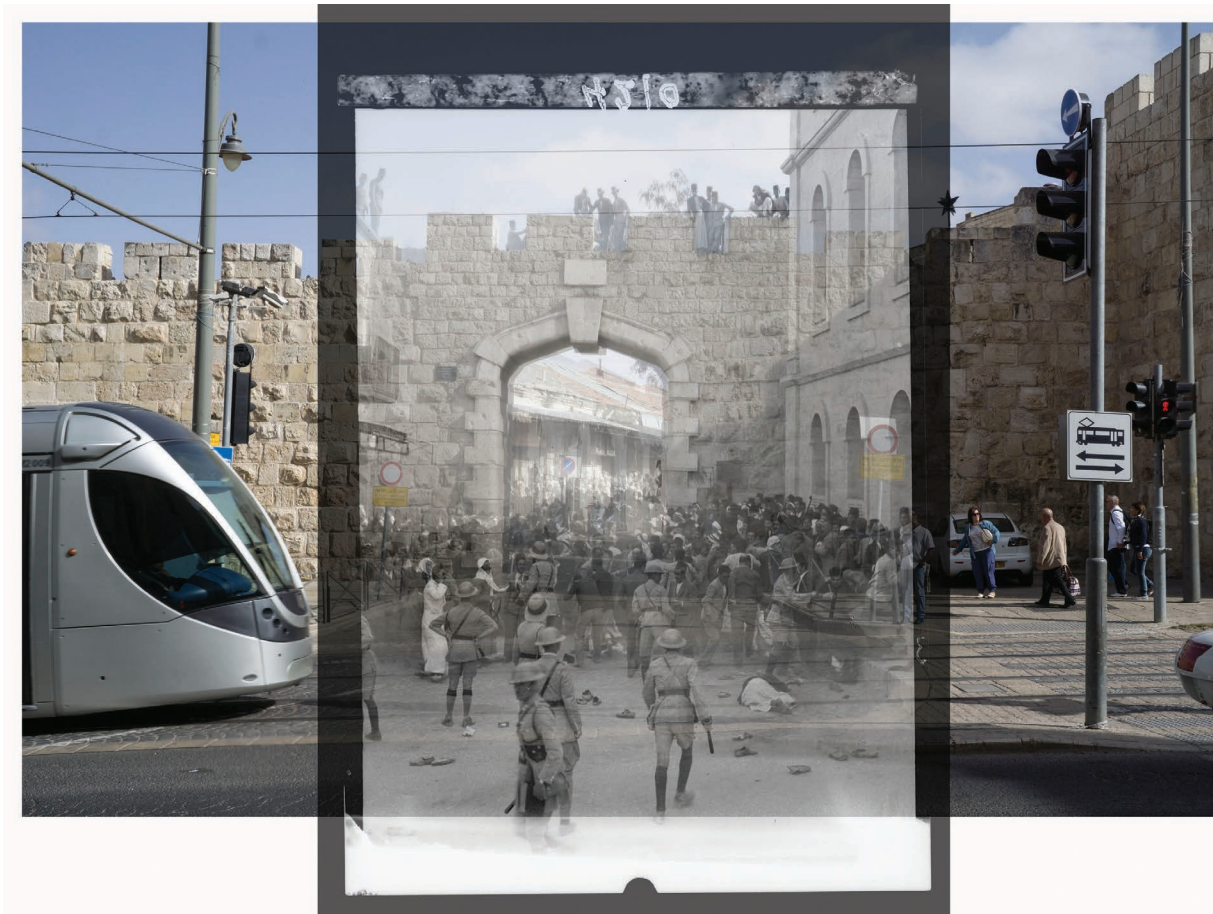
'One Hundred Years' On: The Worn Away Mask of Jerusalem